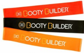
Booty Builder Mini Bands 3-pack