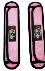
Booty Builder Sleeves 2-pack