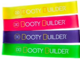
Booty Builder Mini Bands 4-pack