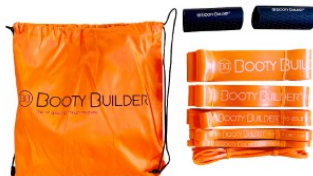
Booty Builder Power Band Kit