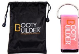
Booty Builder Ankle Strap – Pink